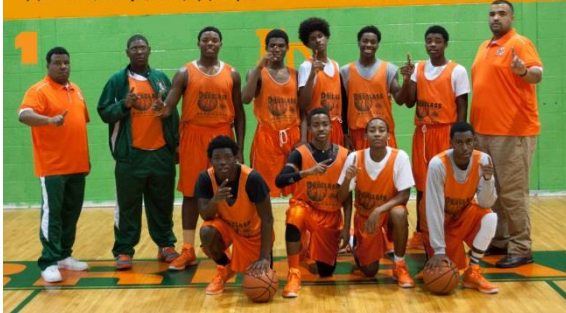
Hurricane Varsity Hoops