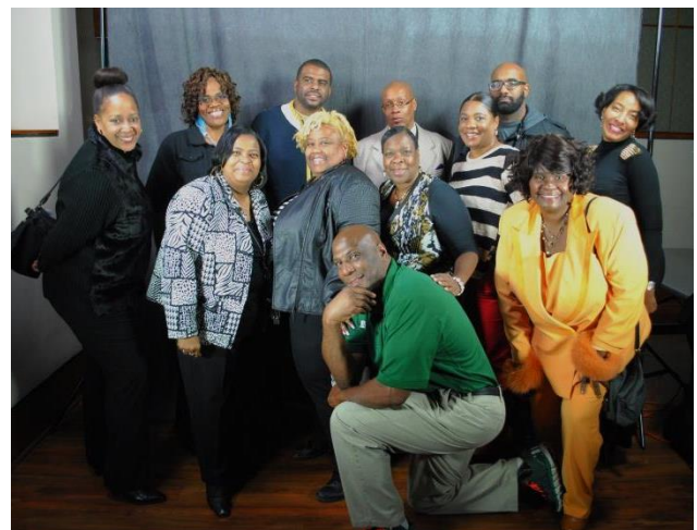
Photo collage on page 2.

"Despite all the hempy ways the young man showed, he still earned straight A's."